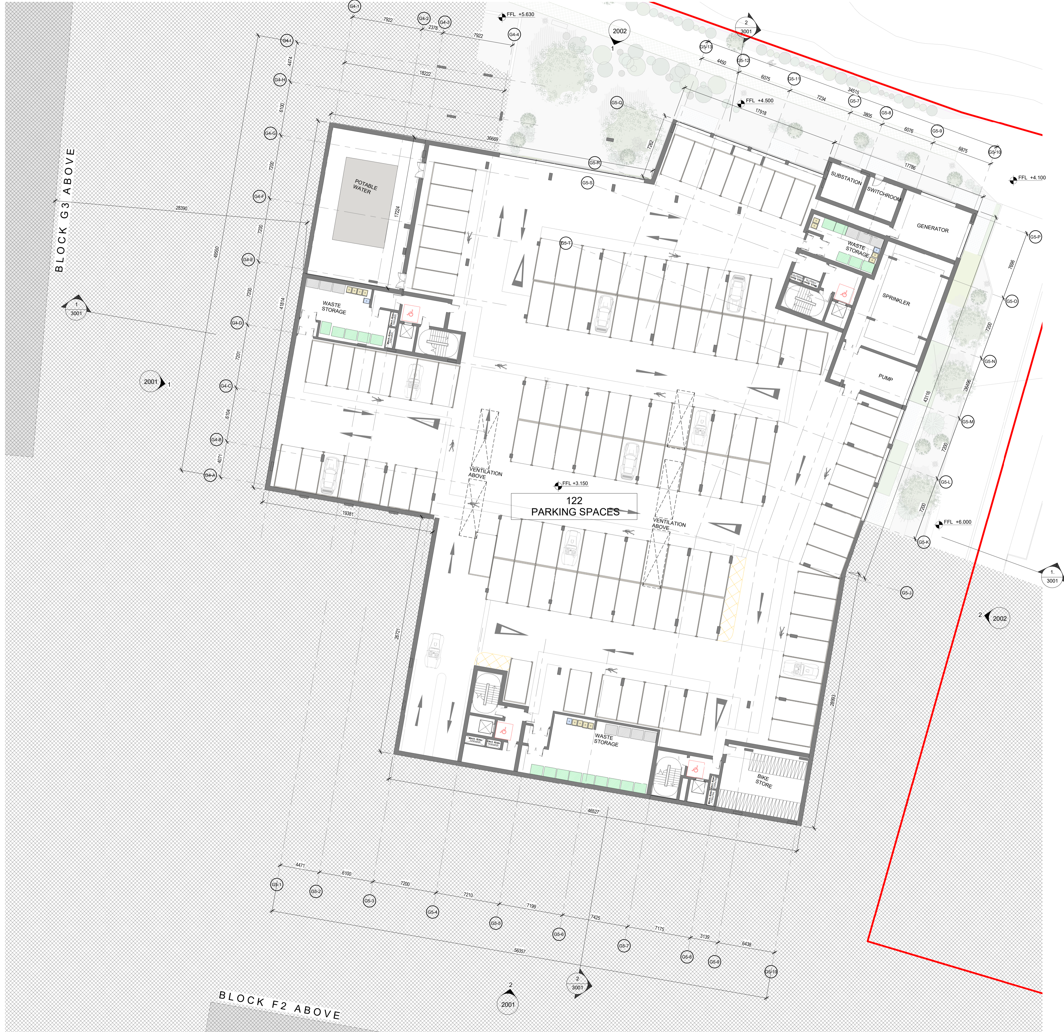
L-01 BASEMENT PLAN 1:200

Architecture + Interiors henrylyons.com +353 1 888 3333 info@henrylyons.com 51-54 Pearse Street Dublin D02 KA66